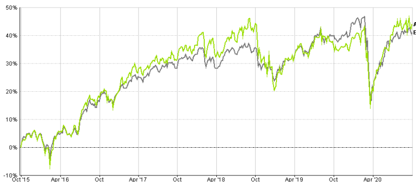
■ A - EF - 8AM Focused A in GB [44.26%] ■ B - IA Flexible Investment GTR in GB [41.20%] Past performance is not a guide to future performance Source: Financial Express 30/09/2015 - 30/09/2020 Data from FEfundinfo2020

Source: Financial Express to 30.09.2020. Sector is the IA Flexible Investment GTR in GB.