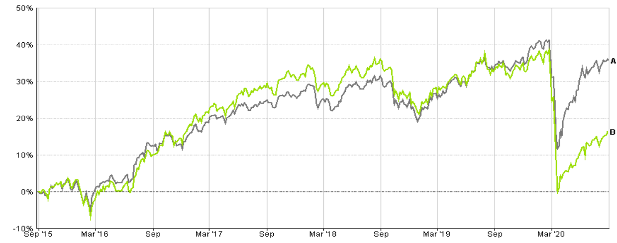
■ A - IA Mixed Investment 40-85% Shares GTR in GB [35.80%] ■ B - EF - 8AM Multi-Strategy Portfolio IV A TR in GB [16.38%]

Past performance is not a guide to future performance Source: Financial Express 31/08/2015 - 31/08/2020 Data from FE fundinfo2020