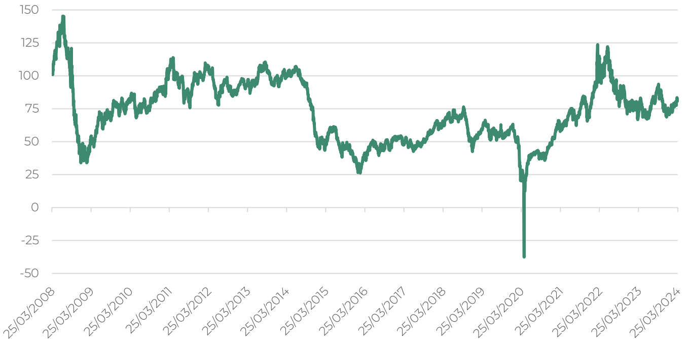
WTI Crude Oil

Important Information: The chart above represents the historic performance of the Underlying Commodity and should not be relied upon as an indication of future performance.